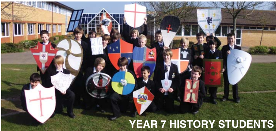
YEAR 7 HISTORY STUDENTS